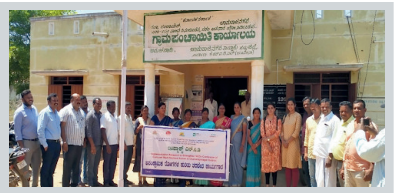
A workshop regarding NCDs was organized in Amachavadi Gram Panchayat, Chamarajanagar