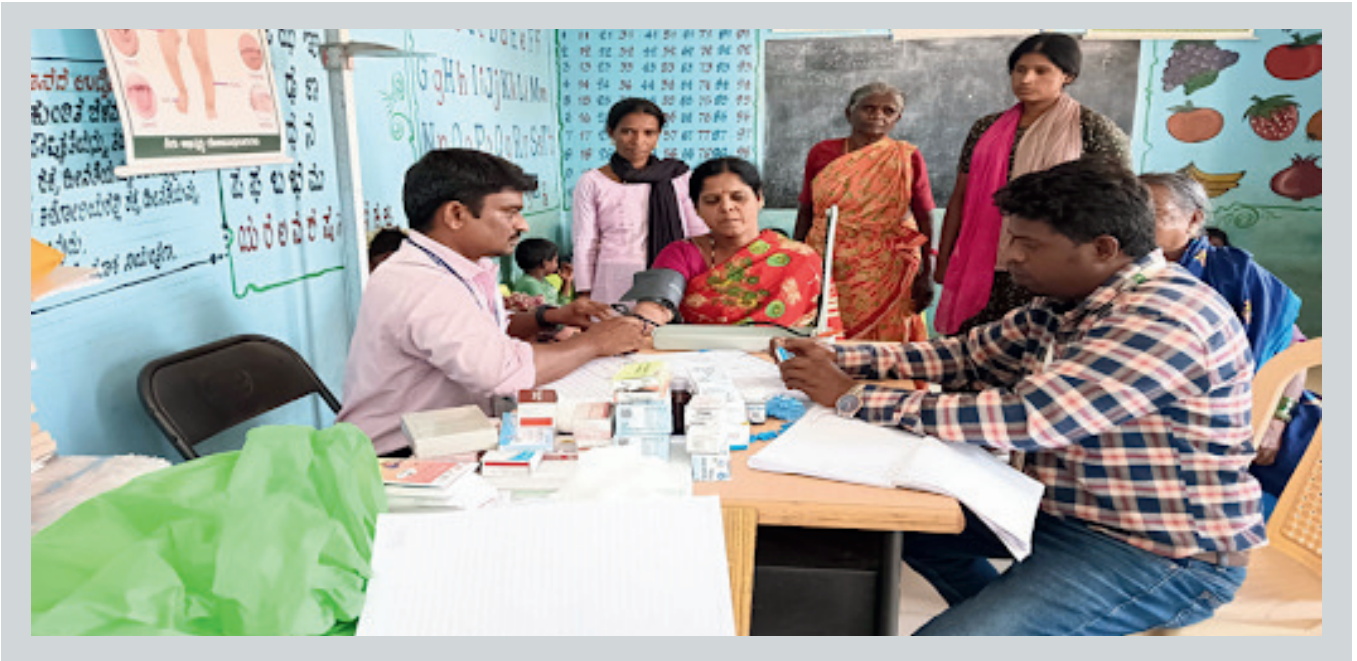
A screening camp was organized and follow up books were distributed to NCD patients by the field staff in Haradanahalli, Chamarajanagar

Under the IMPACT-NCD project—an implementation research initiative aimed at strengthening follow-up and multisectoral action for non-communicable diseases (NCDs) various health promotion, screening, database updates, and capacity-building activities were carried out. In the health and family welfare department, need assessment workshops took place in 5 Primary Health Centers (PHCs), involving 21 Community Health Officers and 5 Medical Officers. Field staff collaborated with the H&FW department to facilitate screening, rescreening, and outreach activities. Accredited Social Health Activists(ASHAs) in 5 PHCs underwent sensitization sessions and NCD screening. Additionally, a workshop on NCDs was organized in a Gram Panchayat, sensitizing 20 elected members and staff. Awareness programs about NCDs were conducted in 4 high schools, reaching 747 students, and 26 teaching and non-teaching staff were screened for NCDs. As part of the continuum of care, 7650 follow-up books were distributed to patients diagnosed with hypertension and diabetes.