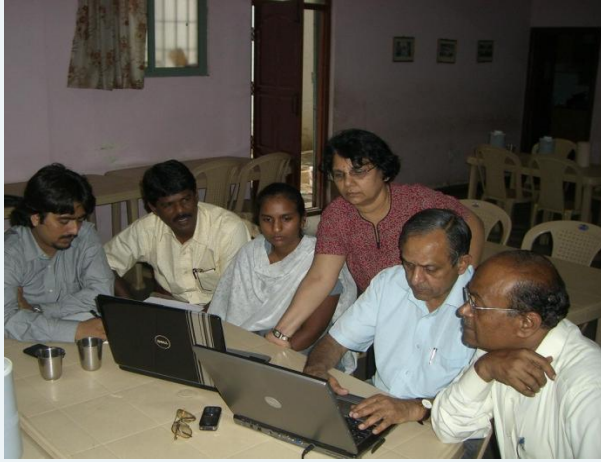
Participants at curriculum development workshop

Two public health experts who are expected to mentor the district team during the programme are now in place. We have been able to ensure partial funding for the programme through the Institute of Tropical Medicine, Antwerp, Belgium and the Government of Karnataka. We are currently negotiating funding from other sources and are hopeful of obtaining it. It is hoped that this pilot will be the precursor for a strong district