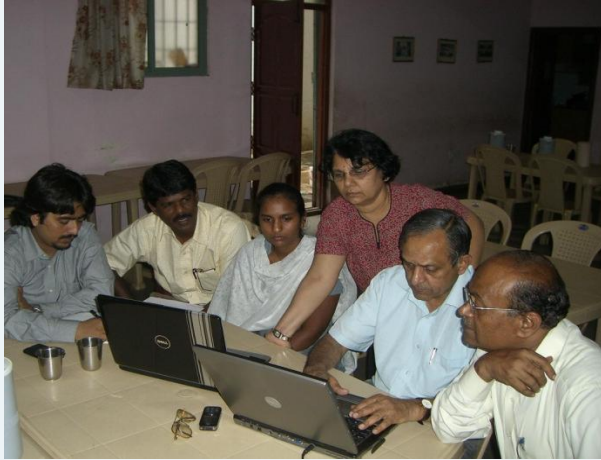
Participants at curriculum development workshop

Two public health experts who are expected to mentor the district team during the programme are now in place. We have been able to ensure partial funding for the programme through the Institute of Tropical Medicine, Antwerp, Belgium and the Government of Karnataka. We are currently negotiating funding from other sources and are hopeful of obtaining it. It is hoped that this pilot will be the precursor for a strong district